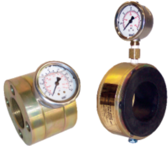
TPS Style Pressure Sensor

Wafer-style Pressure Sensors (WPS) contain only one wetted part, with integral flange gaskets provided by the one piece molded sleeve. They are available to suit all ANSI flange classifications. A variety of sleeve materials are available to provide optimum abrasion and corrosion resistance for different process fluids. Threaded-style Pressure Sensors (TPS) are available with alloy metal and plastic threaded ends for small diameter piping systems.